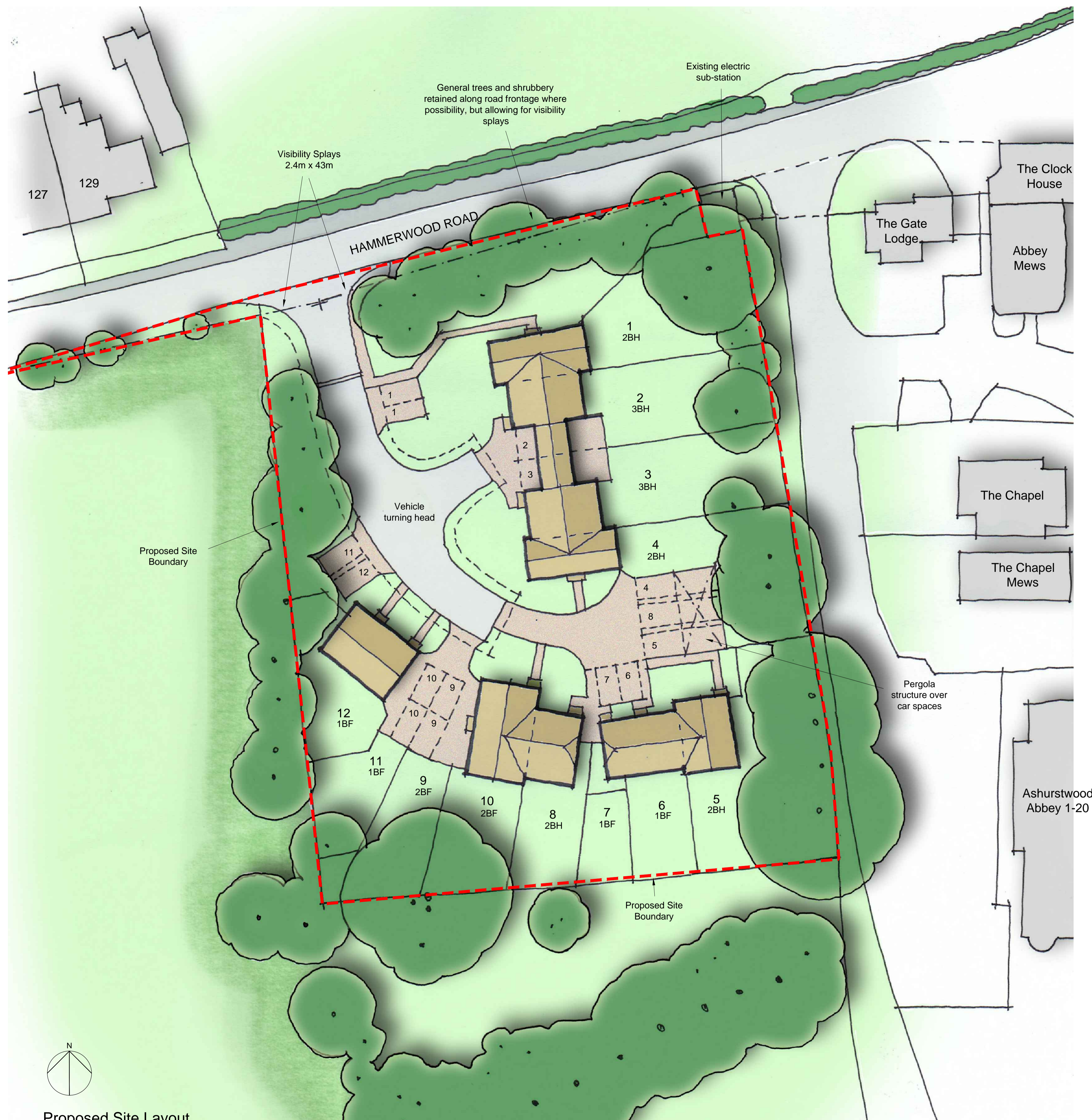
Proposed Site Layout