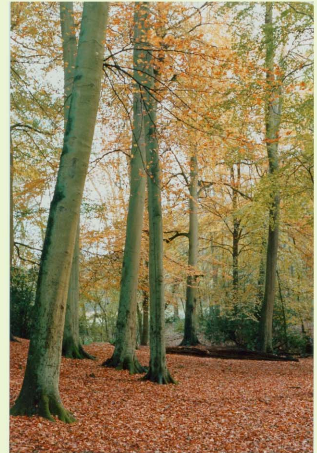
Old Cellars - Sept. 1987.